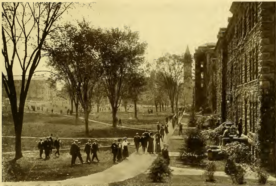
WEST SIDE OF QUADRANGLE